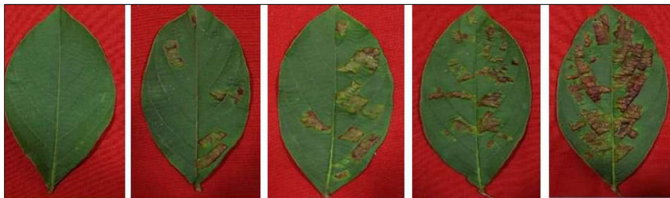
Plate 1. Symptoms progression of leaf spot disease in Lagerstroemialanceolata